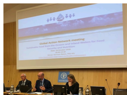
Photo from Network meeting 2018