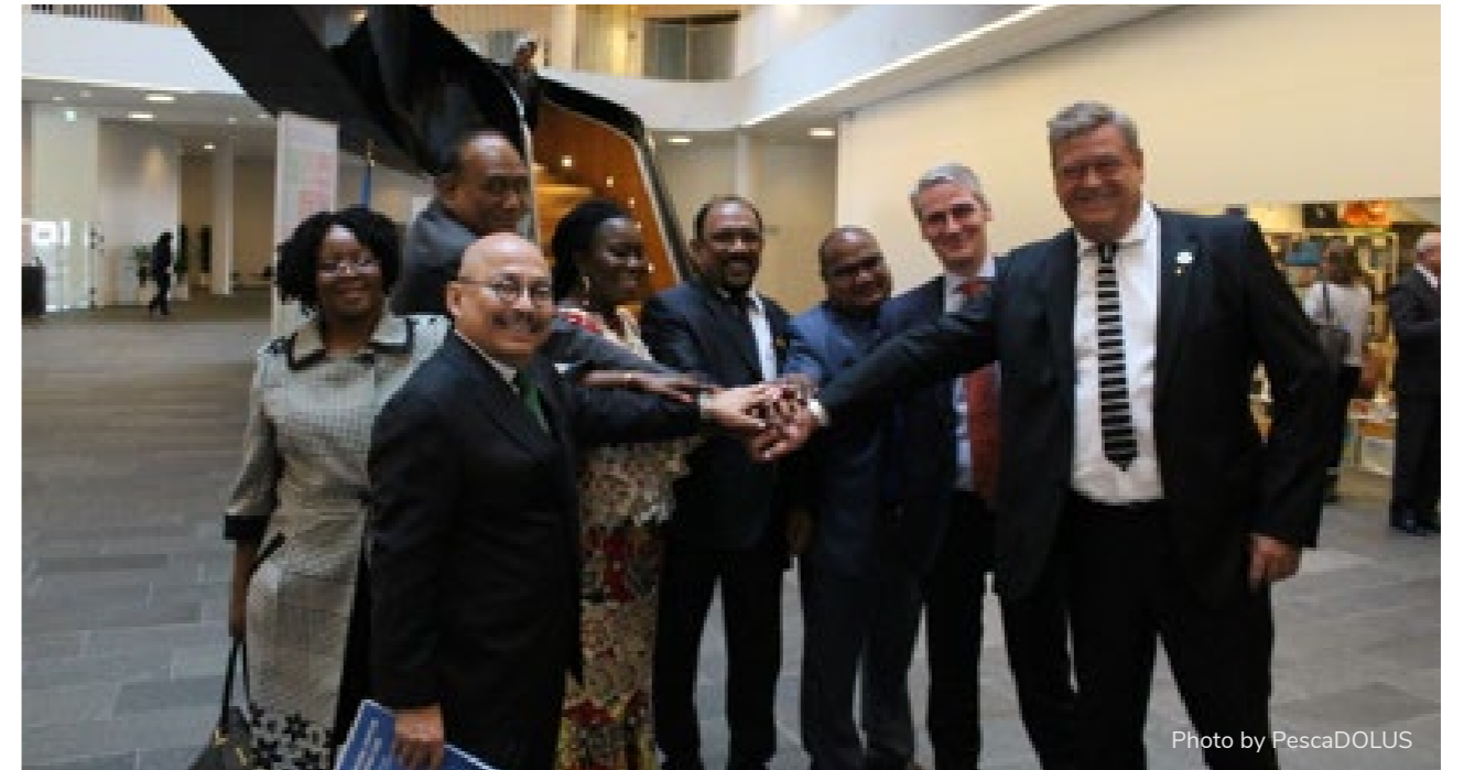
High-level endorsement of the International Declaration on Transnational Organised Crime in the Global Fishing Industry.

The text of the full declaration is included in the report as 'Annex. The International Declaration on Transnational Organised Crime in the Global Fishing Industry'.