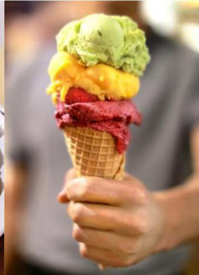
Ice cream, cracker cone