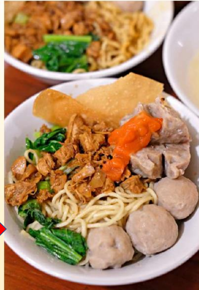
Noddle, fishballs, crackers