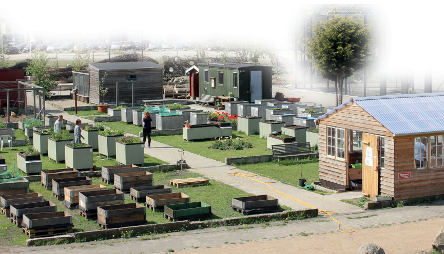
URBACT user network.Sundholm, Copenhagen.

Cyprus partnered with seven other European regions in the Interreg Europe HoCare project to boost delivery of homecare innovative solutions. HoCare aims at optimising Structural Funds investment to strengthen regional innovation system in the field of health care. In the course of the project, Cyprus discovered 'eCare', the smart system of integrated health care developed in Slovenia.