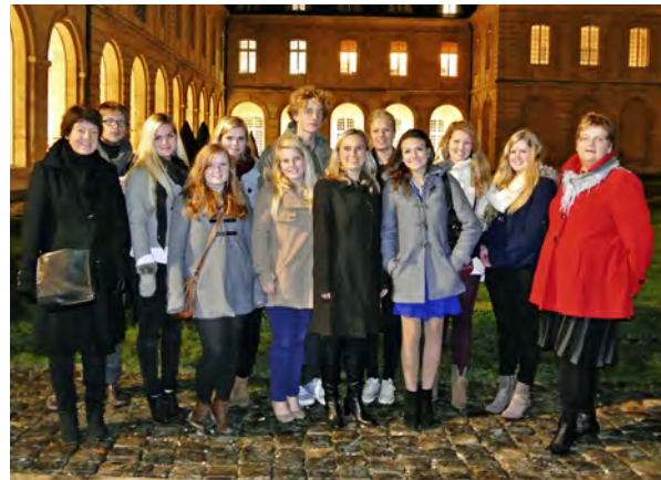
Students from the Hordaland class met with Deputy County Mayor Mona Hellesnes and other representatives from Hordaland during the Boréales festival in November