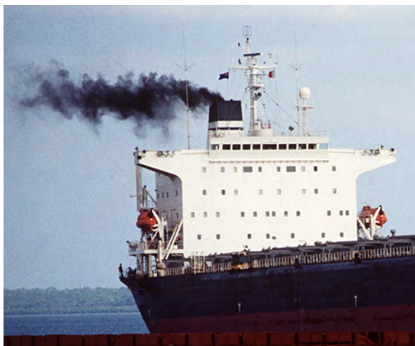
One of the objectives of CNSS is to reduce pollution from large ships while in ports

Finally a report “Policies and Instruments, a baseline knowledge” was published. This report gives an overview of current emission policies, regulations and instruments as well as funding programmes.