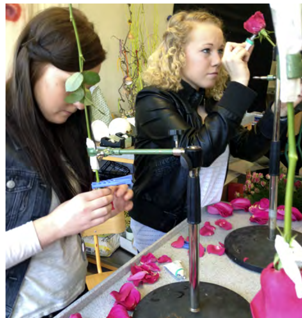
Flower decorators from Hjeltnes horticultural school on placement in Slovenia

In the autumn of 2012 Hordaland County has received one apprentice from Germany, Thüringen, who has worked for