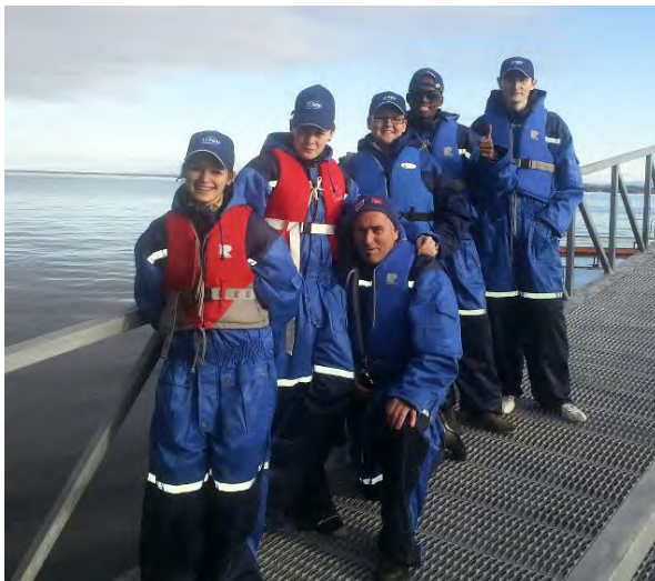
Students from Lycée Rabelais visit an aquaculture installation at Sotra

Sandsli vgs has continued their collaboration with the lycée hôtelier Rabelais in Herouville. This September and October, four students from Lycée Rabelais did work placement at the local restaurants Lucullus Neptun and Jacob's Bar og kjøkken in Bergen.