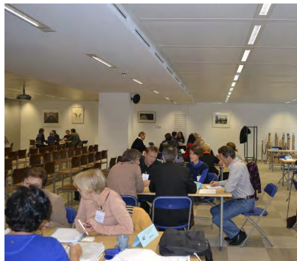
From the workshop in Brussels

On 29th of November, Voss municipality and USHT from Hordaland together with the International section attended a project development workshop on Leonardo da Vinci and Grundtvig in Brussels. The West Norway Office was one of the organisers behind this event. Voss wanted partners for the project proposal "Crossways learning", a cooperation between Voss library and Adult Learning and Speech Pathology. The main focus is to create new arenas for language learning and social integration for immigrants. USHT searched cooperation with European partners on "Capacity building in the primary health sector". During the workshop, representatives for both projects discussed cooperation with possible European partners. Hopefully, there will be applications from both projects in February 2013.