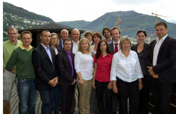
The steering committee during their meeting in Bergen in July 2012

The Portaferm project deals with the use of manure in bio gas plants at farms with minimum 35 farm animals. The Energy Efficiency Network focuses on energy efficiency in companies. More