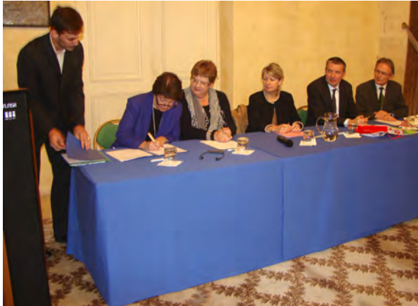
Signing of the agreement on the "Hordaland Class in Normandie"

by the Région, the Academy of Caen and the University of Caen. Both the Norwegian students and their host families attended the ceremony.