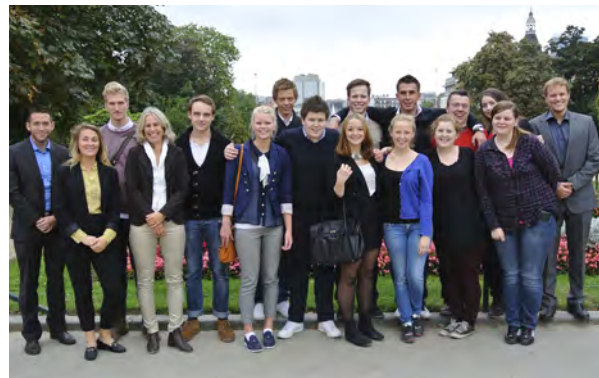
Participants from the Youth Councils of all the three counties of Western Norway

The project was mentioned at the official website of the Norwegian government " Europaportalen " which provides information about Norway's cooperation with Europe.