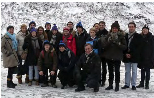
Youth musicians from Bayeux on their way to the Flåm railway

All in all, a successful weekend with new friendships being elaborated and common areas for future cooperation being discussed. The highlight though, was probably the time when our friends from Bayeux were introduced to the local dish – smoked sheep head – including eating the eye. Read more in Avisa Hordaland (in Norwegian)