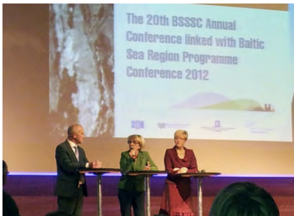
Former European commissioner Danuta Hubner and Norwegian minister for regional affairs Liv Signe Navarsete during the General Assembly

Charlotte Lillefjære-Tertnæs from the International section represented Hordaland at the BSSSC Annual Conference. The conference was part of the European Cooperation Day 2012 where European Cooperation was celebrated all over Europe and in neighbouring countries!