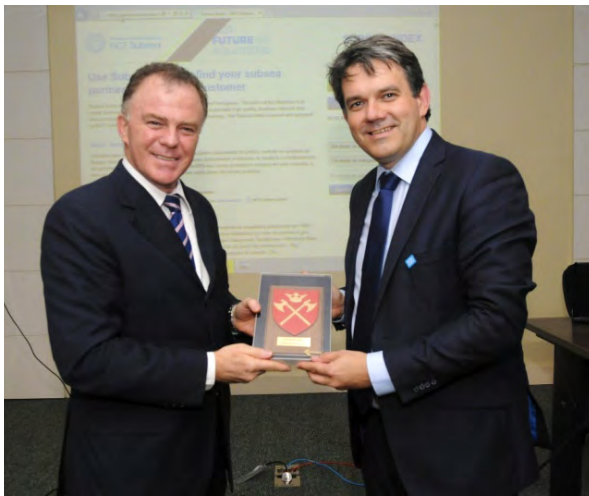
County Mayor Tom-Christer Nilsen together with Governor Renato Casagrande from Espirito Santo

In the period 13th to 21st of September, a joint delegation from the Bergen region/Hordaland and the Stavanger region visited Brazil. The delegation was jointly arranged by Business Region Bergen and Greater Stavanger and counted 35 people in total. The group visited Macae, Rio de Janeiro and Vitoria/Vilha Vela, the latter in the state of Espirito Santo. Mayor of Bergen, Trude Drevland, headed the first part of the delegation (until 17th September) and County Mayor of Hordaland, Tom-Christer Nilsen, the last part.