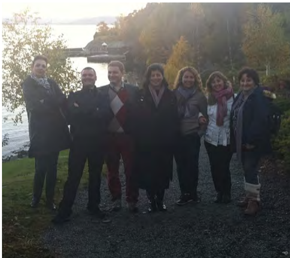
The project group gathered in Bergen in October

The Norwegian educational system has by means of changes in the Education Act and nationally initiated projects tried to encourage a development in which Norwegian pupils have the right to receive more formative assessment during the school year. In this particular Comenius Regio project the Norwegian partners will present theory and research on assessment for learning, and together with the Spanish partners, explore new approaches to develop a more learning oriented assessment practice.