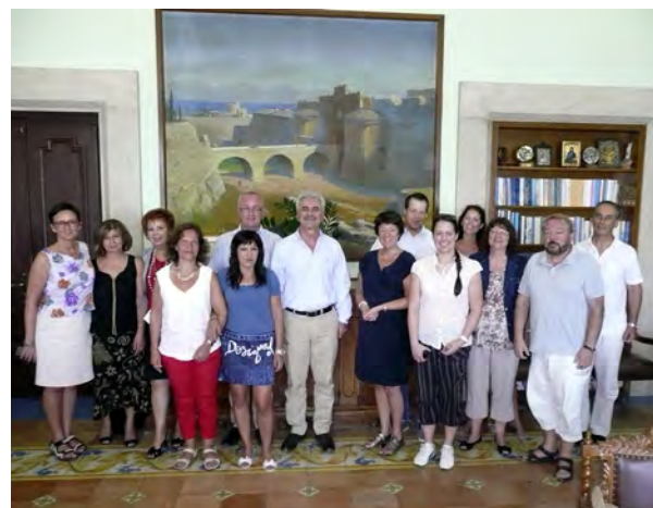
The project group during the first meetings in Rhodes

We look forward to our Greek partners visiting us in the spring of 2013.