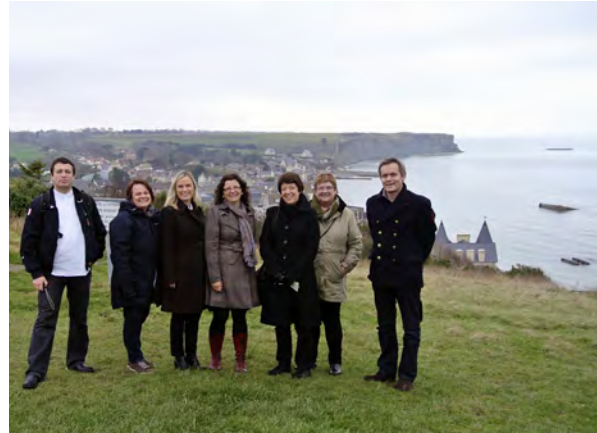
Delegation from Hordaland on the D-Day beaches outside the village of Arramanches

the Institute for Human Rights in Caen in order to discuss possible collaboration. A visit to the different heritage sites on the beaches had also been organised.