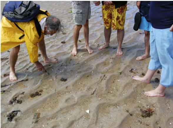
From the environmental course in Coutance.

YOUTH IN ACTION is the EU programme for young people aged 13-30 and youth leaders. It promotes mobility within and beyond the EU borders, intercultural dialogue and non-formal learning ("learning by doing"), and encourages the inclusion of all young people. A variety of activities can get EU support: international youth exchanges, youth democracy projects, local youth initiatives and seminars for youth workers. In addition there is a possibility for all young people aged 18-30 to work and live in one of EU's countries for one year with all expenses covered through the European Voluntary Service (EVS). More