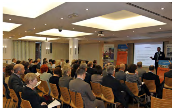
Participants from West Norway and Trøndelag during the introductory seminar at the West Norway Office on 8th October