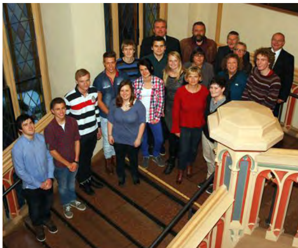
The electro-students in Erfurt

For the first time their practice periods take place in "real" companies, not training centres, which seems to give them a more authentic work practice and also force