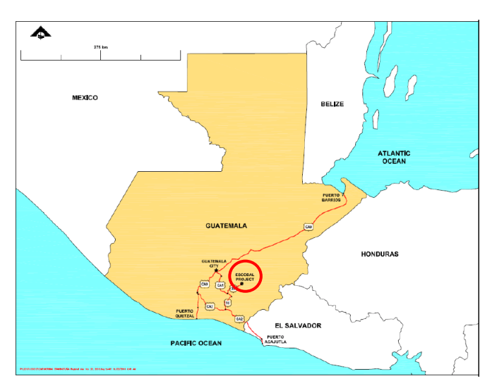
Figure 1: Basic map of Guatemala showing the location of El Escobal. 15